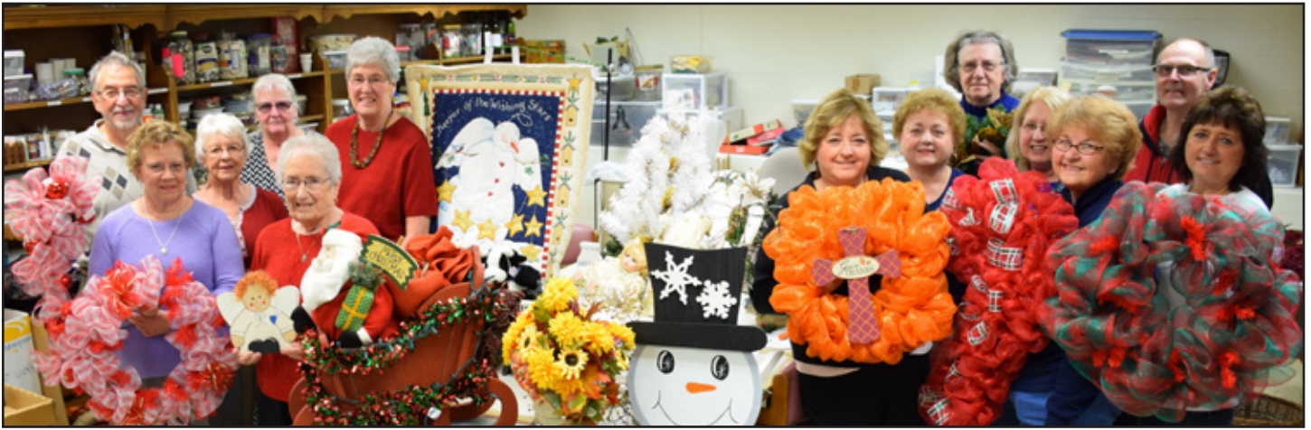
Pictured are St. Paul's volunteers and Auxiliary members preparing for the Annual Craft Show and Bake Sale.

our avid bingo players, just to mention a few.