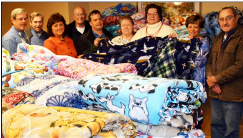
Hand-crafted blankets created and donated by St. Mark's UCC in Knox, PA; most of the blankets and quilts were used for gifts for residents and some of the blankets were sold at the Auxiliary of St. Paul's Annual Craft Show.

iliary for all you have done throughout your 43 years. Thank you for your endless support and countless contributions.